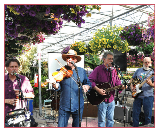
YUNS JUG BAND, OUR TALENTED AND VERSATILE BAND, ENTERTAINED THE GUESTS WITH SONGS OLD AND NEW.

Many thanks, too, to all of those who donated items for the Silent Auction.