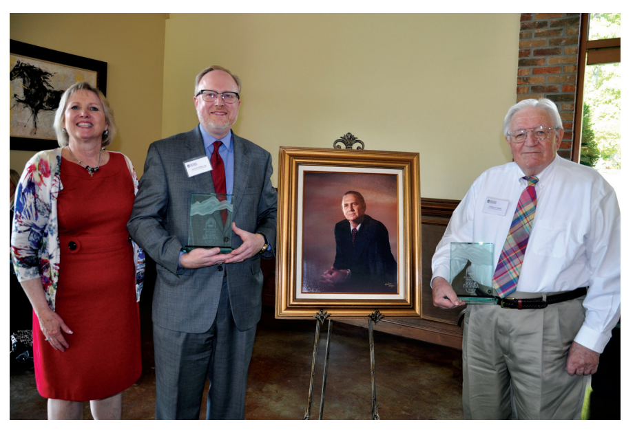
who live in Knoxville or Knox County. The agency also provides referrals to these services when needed. ■

SCIRS provides free information about services for older persons and persons with disabilities