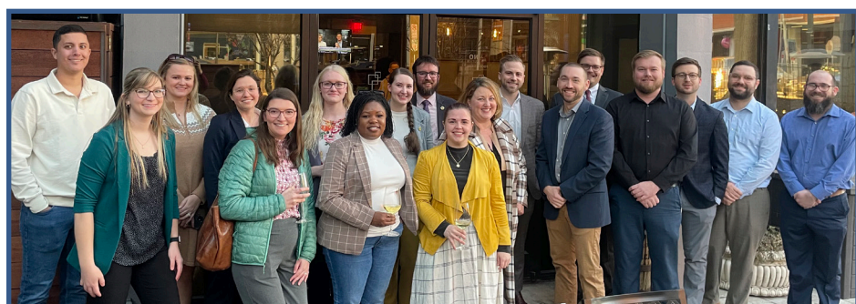
Business Award The Knoxville Barristers

Tickets to the Duncan Awards are free and available online at knoxseniors.org/duncan2025 or by calling 865-546-6262. RSVP requested. Donations accepted.