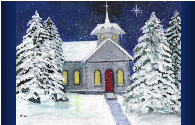
The art featured on the front of this card was painted by a member of the O’Connor Senior Center Painting Class, who graciously donated its use to the Mobile Meals program.

Just in time for the holidays, Mobile Meals is once again selling Holiday Cards for you to send to your family, friends, and loved ones. The cards are blank inside so you can personalize them with your own message. A pack of ten cards with envelopes is $10. Proceeds go to Mobile Meals to provide nutritious meals to homebound older adults in every zip code in Knox County.